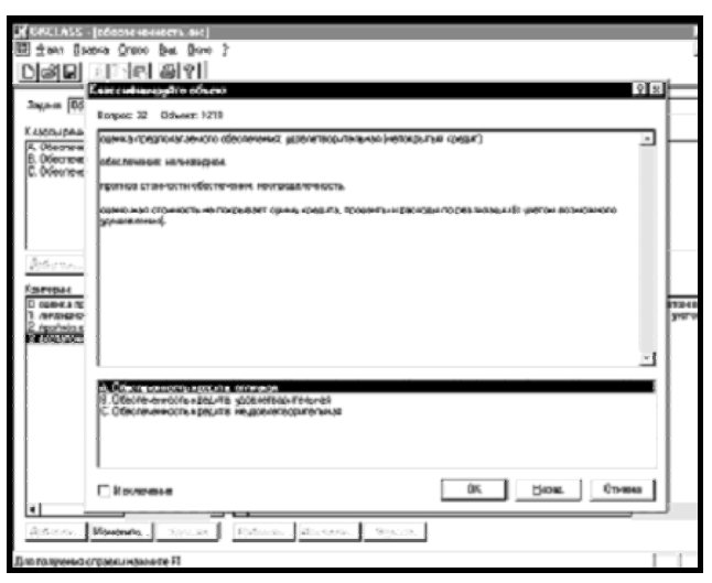
Fig. 2. Subsystem ORCLASS during Creation of Classification

The subsystem OREX (ORCLASS the Expert) is intended for formation in the mode of dialogue with the user of the description of object of classification and distribution of its class of the decision. OREX al-